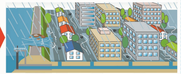
If heavy rain continues, river levees may collapse, causing large scale damage.