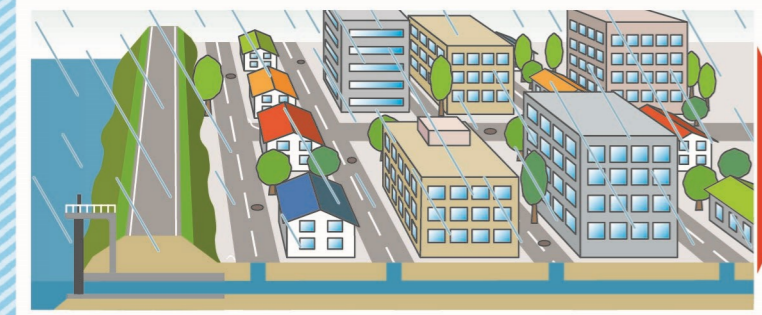
Rain that falls on residential areas and roads is drained into rivers through sewers and waterways.