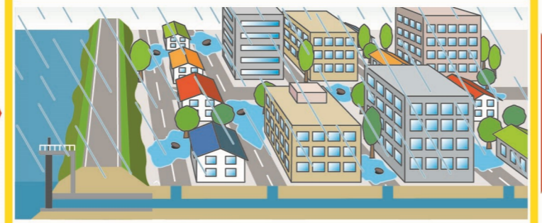
When heavy rain falls, rainwater cannot drain away, causing flooding in residential areas and roads.