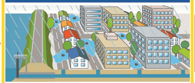
When heavy rain falls, rainwater cannot drain away, causing flooding in residential areas and roads.