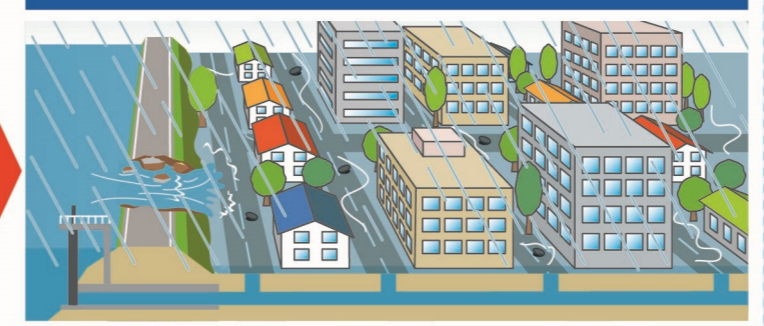
If heavy rain continues, river levees may collapse, causing large scale damage.